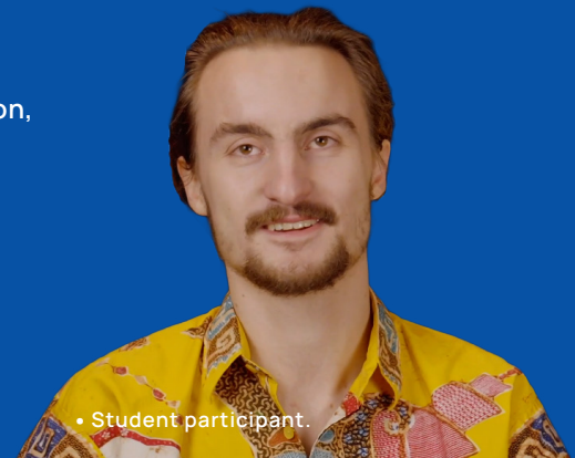
• Student participant.

From online try-outs to an offline hackathon, 3 teams of 6 winners bested over 200 participants with their impressive skills in solving 5G and 6G problems at the 2022 Huawei Sweden Tech Arena in Stockholm!