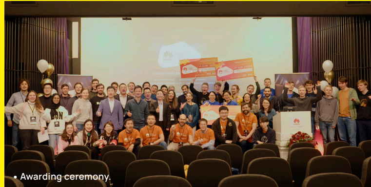
• Awarding ceremony.