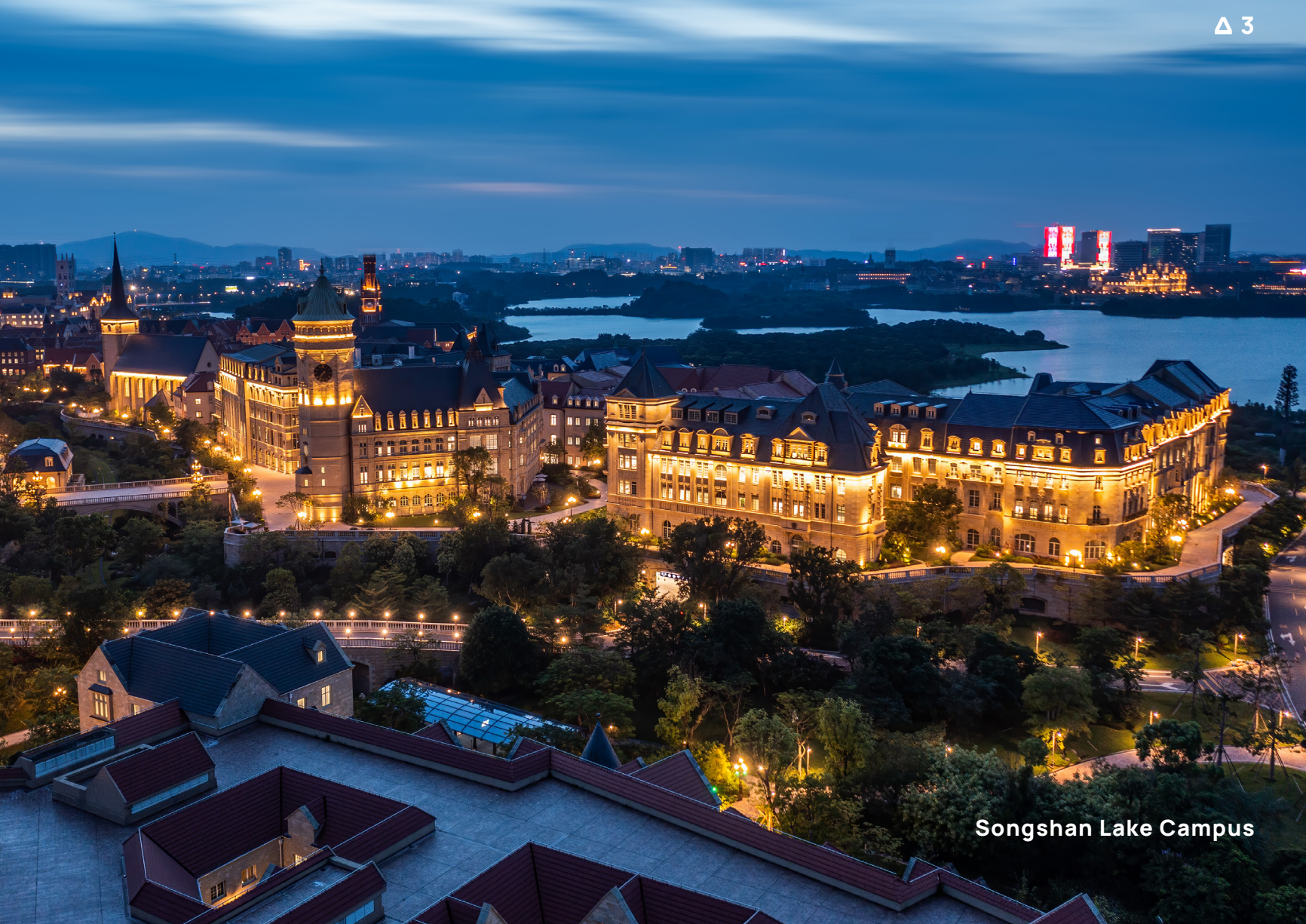
Songshan Lake Campus