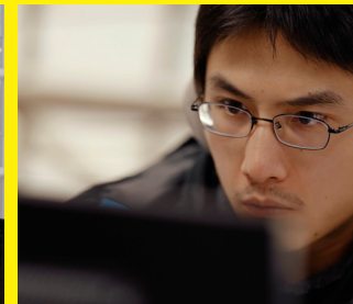
• Students coded programs onsite during 24-hour Tech Arena hackathon.